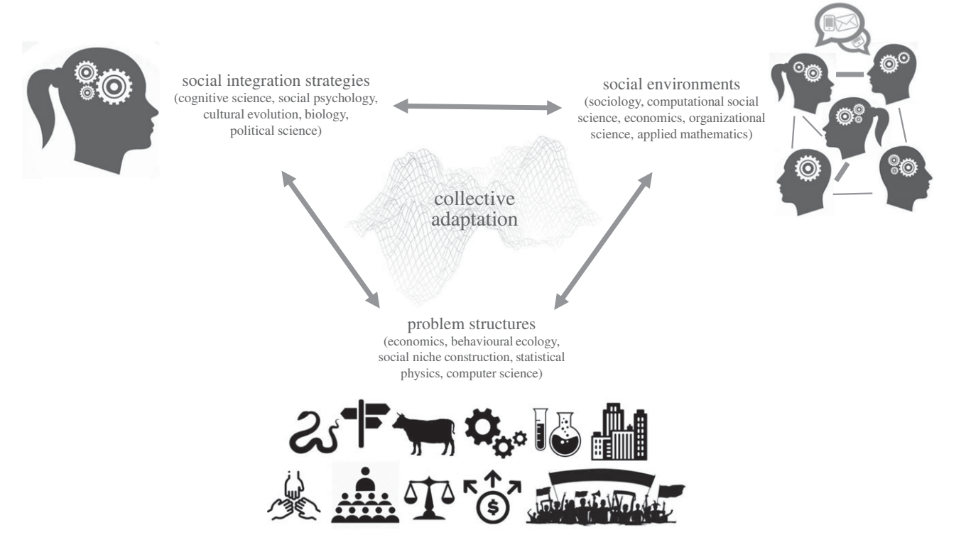
Figure 1. Collective adaptation can be seen as an emergent property of a complex socio-cognitive system driven by dynamic interactions of social integration strategies, social environments and problem structures collectives face. Collectives take different trajectories when navigating the complex adaptive landscape of these interactions. The system components are wholly entangled, but each has been studied in relatively isolated disciplines, and extant models of collective dynamics rarely include all components. Combining relevant findings and methods in different disciplines (box 1) is critical for understanding collective adaptation, avoiding parallel efforts (box 2) and building quantitative models that enable answering important outstanding theoretical and practical questions about human sociality.